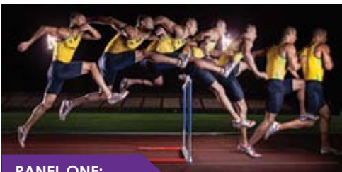
PANEL ONE: THE STUDY OF SPORT

SEVERSON AUDITORIUM, SCARBOROUGH HALL ROCKFORD UNIVERSITY 5050 E. STATE ST., ROCKFORD, IL 61108